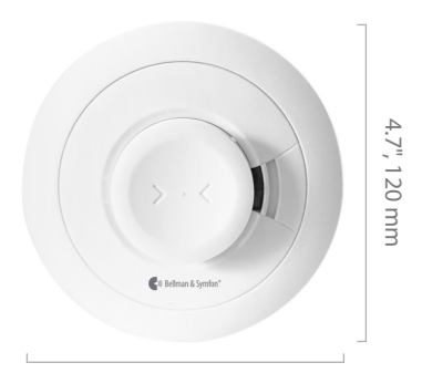
4.7", 120 mm